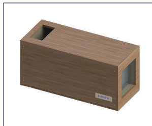
Wall mounted shelf enclosure conceals unit and optimized airflow.

Bluezone® by Middleby makes indoor dining and working spaces safe again with patented, ultraviolet air cleaning technology that kills up to 99.9995% of viruses in the air, including SARS-CoV-2 (corona-virus). Air is pulled into a chamber, is scrubbed of contaminants, and purified air is returned to the space.