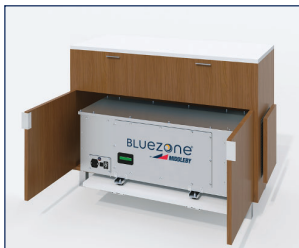
Plug & play cabinets designed to maximize airflow.