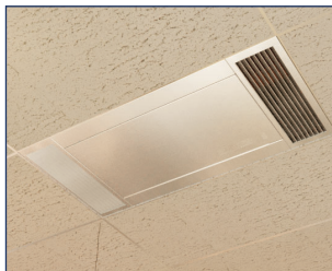
Ceiling Mount Kit replaces 2 x4 drop ceiling panel.