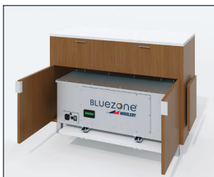
Plug & play cabinets designed to maximize airflow.