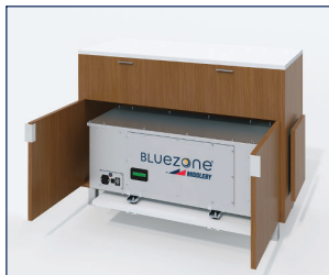
Plug & play cabinets designed to maximize airflow.