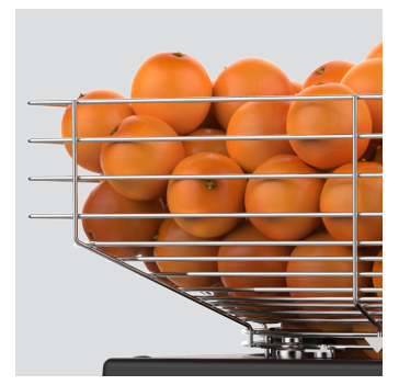
Basket capacity 44 lbs

Greater yield: the new kit leads to greater juice extraction yield. Thanks to its new design, up to 10% more juice can be obtained.