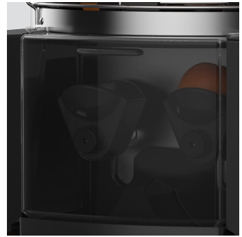
Smoky grey front cover

WARNING: This product can expose you to chemicals including bisphenol A, which is known to the State of California to cause cancer and birth defects or other reproductive harm. For more information go to www.P65Warnings.ca.gov