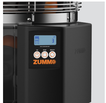
Higher juice extraction speed