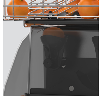
Smoky grey front cover