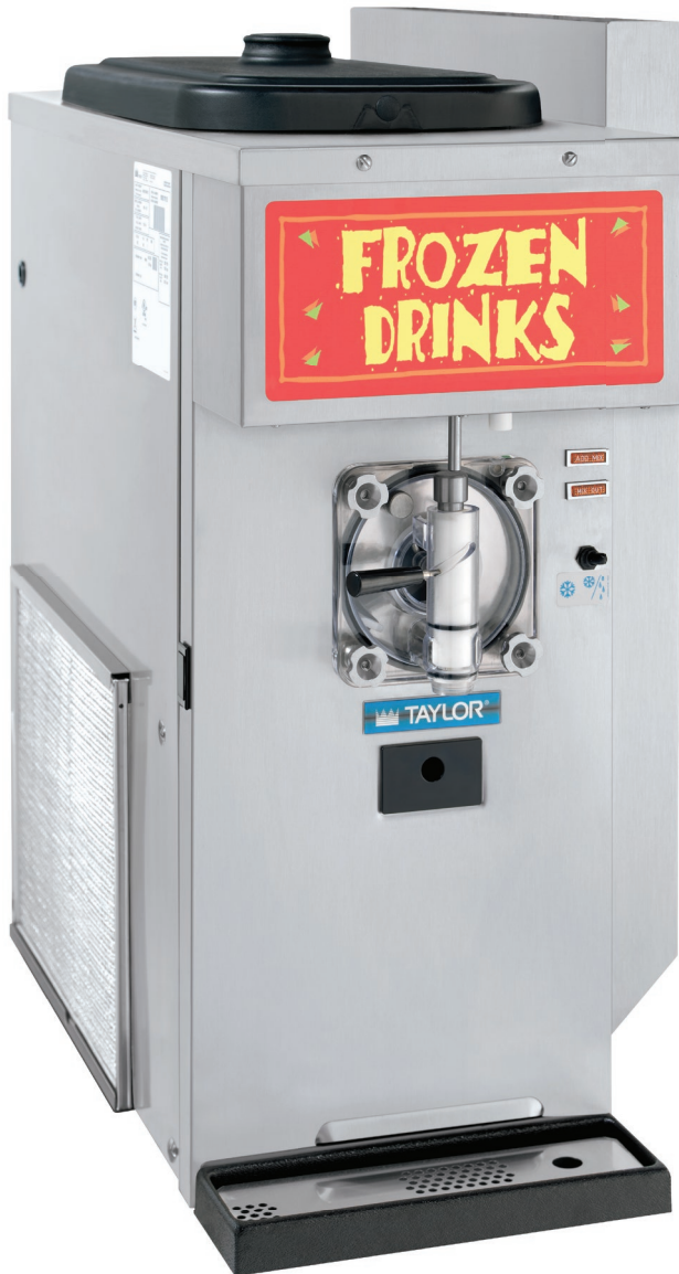
Shown with optional top air discharge chute

Removable, cleanable and reusable air filter keeps the condenser clean for optimal refrigeration system performance.