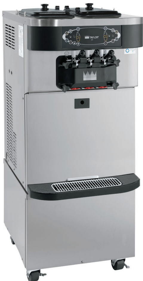
Shown with optional ADA cart