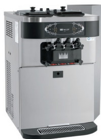
Shown with optional top air discharge chute