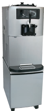
Optional Cart with front opening door