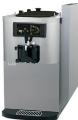
Optional Top Air Discharge Chute