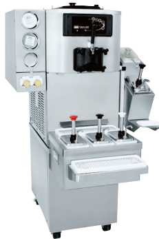
Optional Cart with rear door for front mount syrup rail