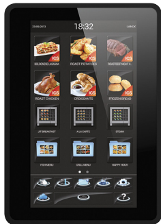
LCD 10" Touch Screen