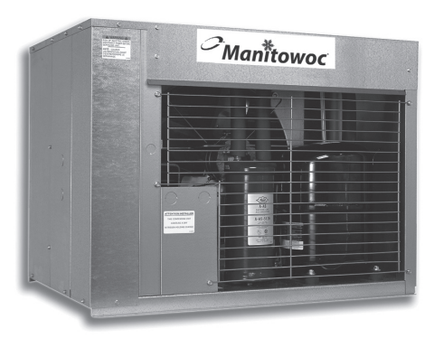
RCU -2375 Condensing Unit - 208-230V, three phase