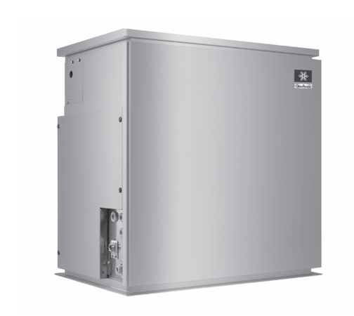
RFS-2378C Remote Flake Ice Machine - 208-230V, single phase