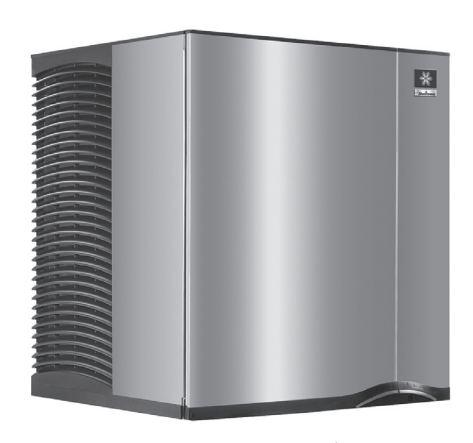
RN-1278C Remote Nugget Ice Machine - 115V