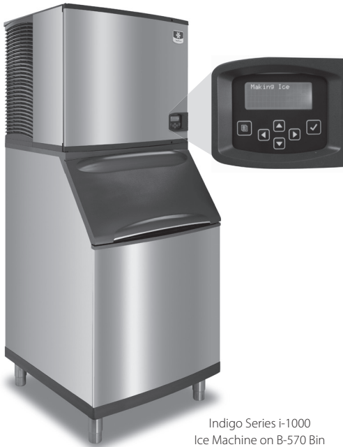
Indigo Series i-1000 Ice Machine on B-570 Bin

Designed for operators who know that ice is critical to their business, the Indigo™ Series ice machine's preventative diagnostics continually monitor itself for reliable ice production. Improvements in cleanability and programmability make your ice machine easy to own and less expensive to operate.