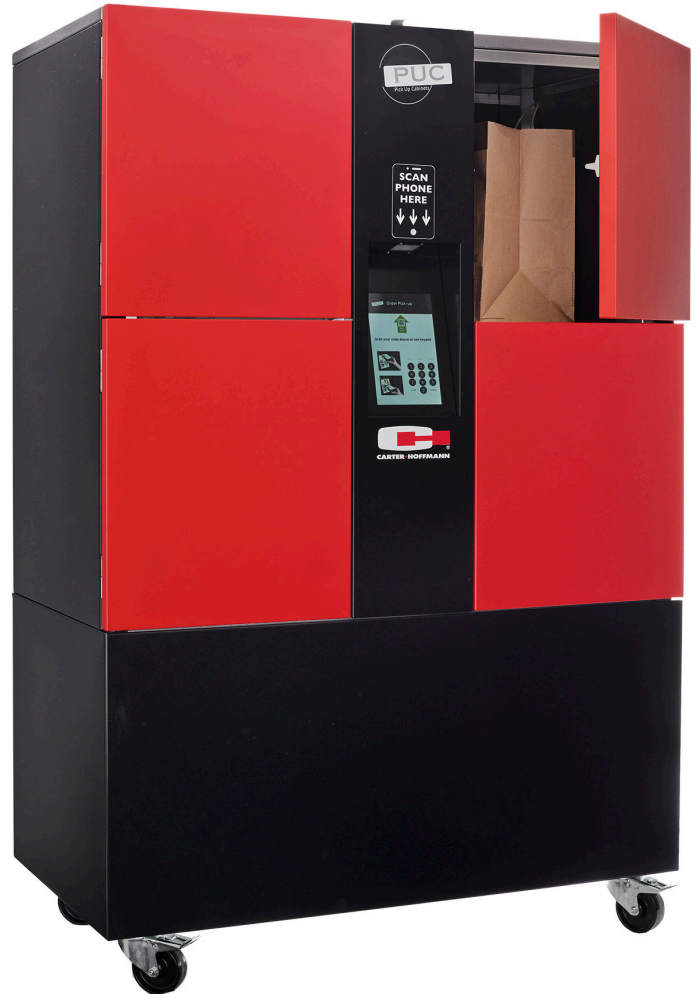
PUCA-22 Shown with optional stand (PUC-S-27)