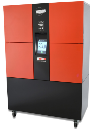
PUCA-22 Shown with optional stand (PUC-S-27)

Carter-Hoffmann's PUC Smart Order Cabinets are ideal for your automated pick-up program. Customers order online, receive a QR code, and when they arrive, scan the code to open the door for their order. You can use PUC cabinets as free-standing units, or integrate with your POS to collect and analyze data for every order. All that is needed is a WI-FI connection.