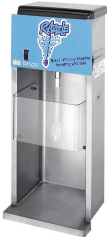
Shown With Spoon Agitator