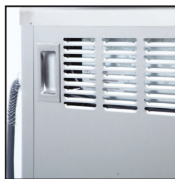
Shown with standard pull handles