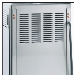
Shown with optional rear mix lights