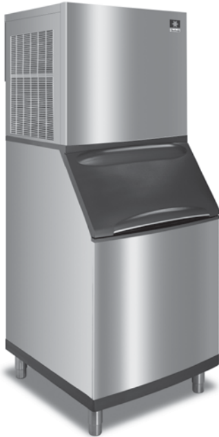
Model RFS-1200A Flake Ice Machine on B-570 Bin