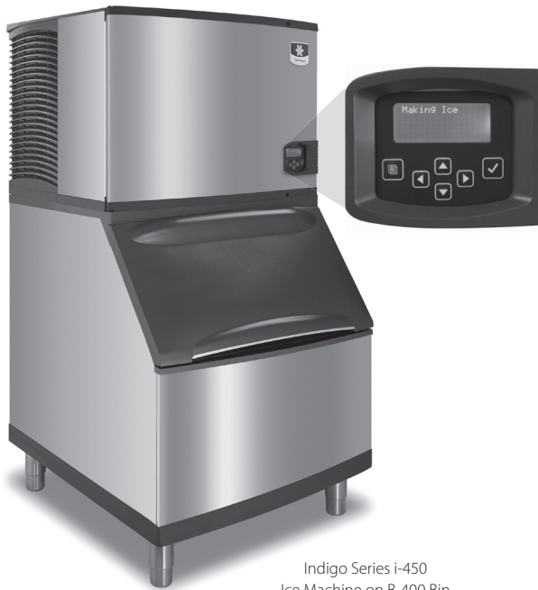
Indigo Series i-450 Ice Machine on B-400 Bin

Designed for operators who know that ice is critical to their business, the Indigo™ Series ice machine's preventative diagnostics continually monitor itself for reliable ice production. Improvements in cleanability and programmability make your ice machine easy to own and less expensive to operate.