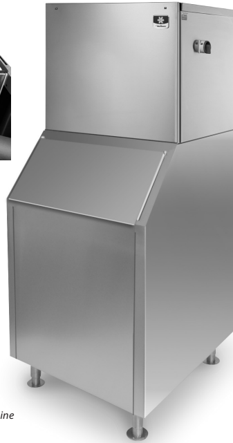
Series i606 ice machine on a MB-3044 bin