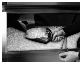
Ice scoop and chain